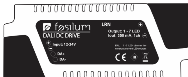
Standard DALI 1ch LED ballast profile